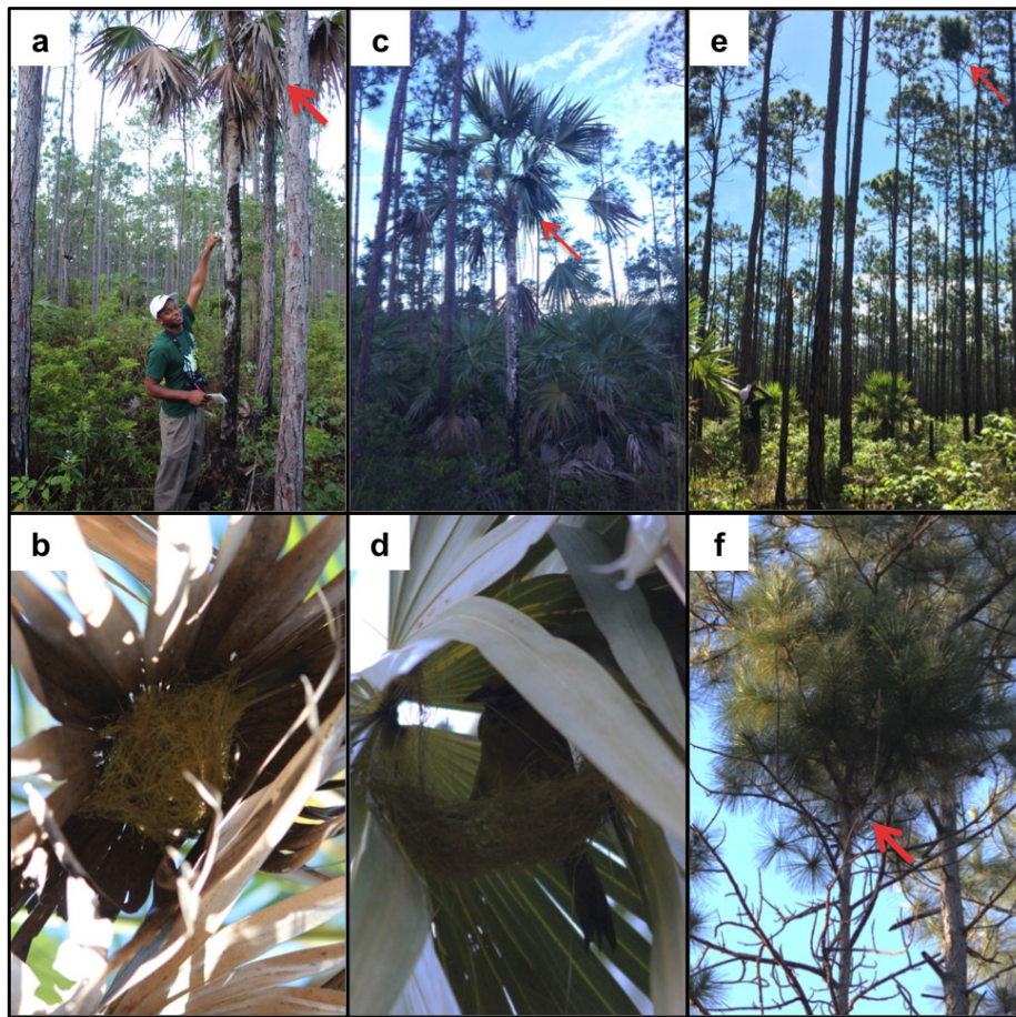
Fig. 2. Photographs of the Bahama Oriole nests and nesting trees documented deep in the pine forest: (a, b) nest 1, (c, d) nest 2, and (e, f) nest 3. Nests 1 and 2 were in Key thatch palm; nest 3 was in Caribbean pine. The top three photographs (a, c, e) show the general placement of the nests (highlighted by red arrows); the bottom three photographs (b, d, f) show closer views of the nests. (b) shows the tail of an SY individual and (d) shows the front of an SY individual building a nest (palm fiber in bill). (f) shows the general placement of the nest (red arrow); both parents at this nest were in full adult plumage (ASY).

of Icterus seem to strongly prefer nesting in palms (Jaramillo and Burke 1999, Campbell et al. 2016). However, coconut palms are native to the Indo-Pacific and only arrived in the Bahamas in the last 500 yr or so with European colonists (Gunn et al. 2011). Thus, it is logical to conclude that Bahama Orioles have likely long used thatch palms as nesting trees, and it seems likely that pine forests may be one of the habitats that these orioles have used for at least tens of thousands of years.