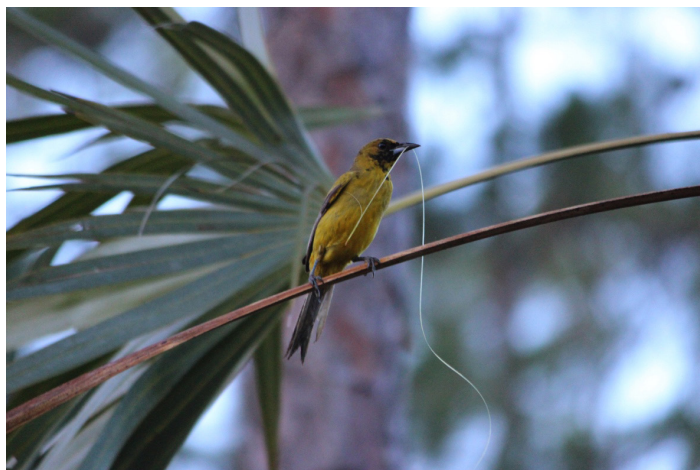
Fig. 3. SY Bahama Oriole carrying a palm frond fiber as nest building material. This likely female was constructing a nest in an understory Key thatch palm within a pine forest.