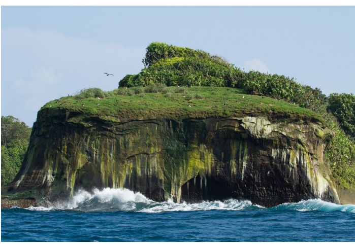
Fig. 2. Rocky cliffs on offshore islands provide protected nesting sites. Escudo de Veraguas, shown here, supports Brown Booby nesting.

tended by the Guna people. Throughout most of the Comarca de Guna Yala, the Serranía del Darién is close to the coast, reaching it in some places to form rocky shorelines or sea cliffs. Where unprotected by reefs, islands, or coves, the surf is relatively high all year, owing to incoming swells from the Caribbean Sea. This restricts foraging areas of wading birds to protected sites.