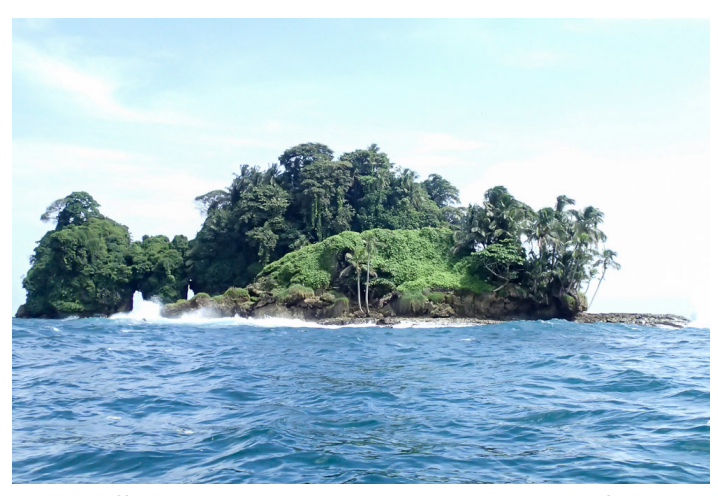
Fig. 1. Offshore islands along the Caribbean coast of Panama provide nesting sites for seabirds. Isla de los Pájaros, off Isla Colón in Bocas del Toro Province, supports colonies of Red-billed Tropicbirds and Brown Boobies.