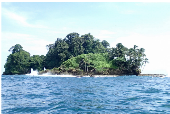
Fig. 1. Offshore islands along the Caribbean coast of Panama provide nesting sites for seabirds. Isla de los Pájaros, off Isla Colón in Bocas del Toro Province, supports colonies of Red-billed Tropicbirds and Brown Boobies.