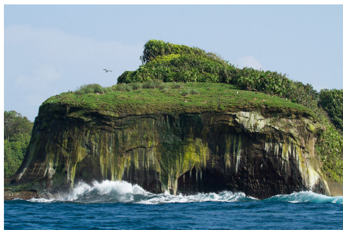
Fig. 2. Rocky cliffs on offshore islands provide protected nesting sites. Escudo de Veraguas, shown here, supports Brown Booby nesting.

tended by the Guna people. Throughout most of the Comarca de Guna Yala, the Serranía del Darién is close to the coast, reaching it in some places to form rocky shorelines or sea cliffs. Where unprotected by reefs, islands, or coves, the surf is relatively high all year, owing to incoming swells from the Caribbean Sea. This restricts foraging areas of wading birds to protected sites.