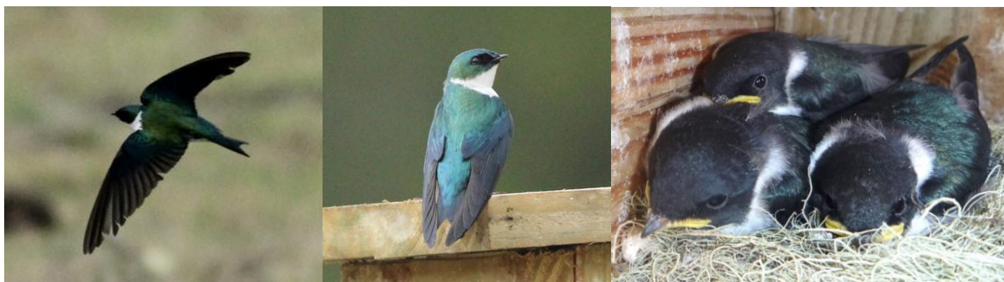
Fig. 1. Hispaniolan Golden Swallows in Parque Valle Nuevo, Dominican Republic. Left to right: adult in flight; adult perched on artificial nest-box; and nestlings 25 days after hatching—1 day prior to fledging (Proctor et al. in press). The Jamaican Golden Swallow would be difficult to distinguish from the Hispaniolan Golden Swallow under normal field conditions, although the white collar may not have extended as far around the lower nape. Golden Swallows can be distinguished at a distance from other Tachycineta swallows by the presence of an almost complete white collar, green luster especially noticeable on the head and upper mantle, and comparably smaller size and less robust build.

Graves (2014) conducted island-wide surveys for the Jamaican Golden Swallow from 1994 to 2012. Though his extensive search efforts did not produce a positive sighting, two large tracts of land remained to be fully explored, including the interior of