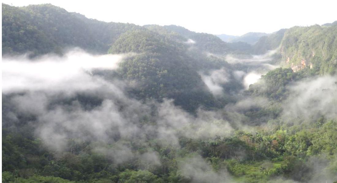
Fig. 3. Barbecue Bottom, Trelawny Parish, in eastern Cockpit Country, site of the last known observation of the Jamaican Golden Swallow.

matrices with few species and equiprobable sites (Gotelli 2000). We performed the statistical analysis using the software R (version 3.0.1; R Core Team 2013) and the package EcoSimR (Gotelli and Ellison 2013).