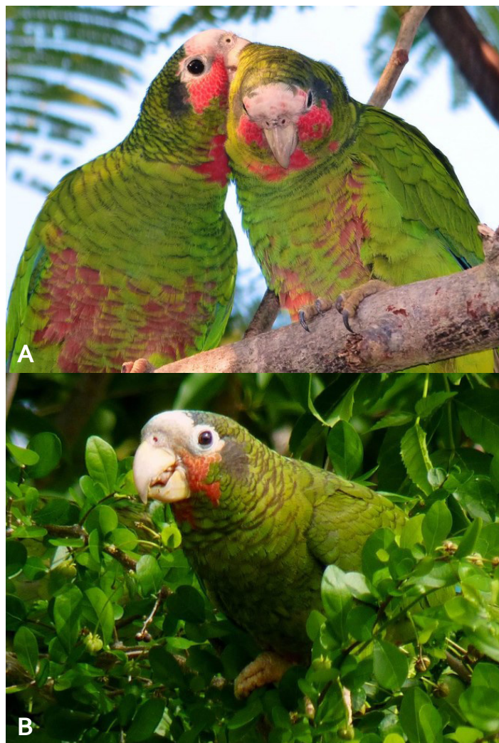
Fig. 1. Grand Cayman (A) and Cayman Brac (B) Parrots can be detected as singles, in pairs, or in clusters of variable sizes.

sera simaruba ), silver thatch ( Coccothrinax proctorii ), cedar tree ( Cedrela odorata ), sea grape ( Coccoloba uvifera ), and buttonwood ( Conocarpus erectus ); as well as plants typical of degraded