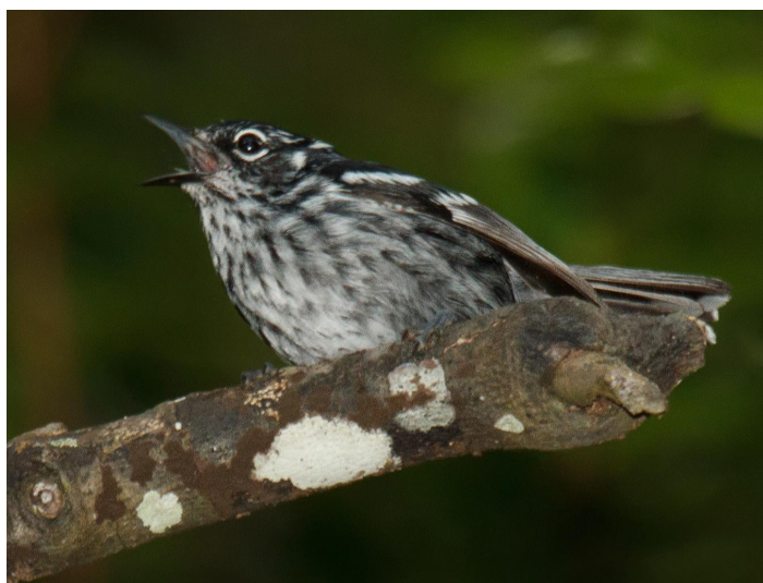
Fig. 1. Adult Elfin-woods Warbler singing in Maricao Commonwealth Forest.

The endemic Elfin-woods Warbler ( Setophaga angelae ) is restricted to the montane forests of Puerto Rico (Figs. 1 and 2). Soon after its discovery in El Yunque National Forest (EYNF) in 1968 (Kepler and Parkes 1972), a second population was found in Maricao Commonwealth Forest (MCF; Fig. 2; Gochfeld et al. 1973). At that time, due to the geographic separation of c. 128 km between the two populations, it was suggested that the species might have been widespread in the high mountains of Puerto Rico (Gochfeld et al. 1973) before the massive forest clearing that happened prior to the 1950s (Wiley 1986). Subsequently, another population was found in Carite Commonwealth Forest (CCF; Fig. 2; Pérez-Rivera and Maldonado 1977) where it continued to be seen during the 1980s and 1990s, but has not been ob-