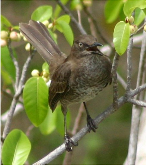
Fig. 13. Scaly-breasted Thrasher ( Allenia fusca ) above Britannia Bay, 27 January 2010.

five, but typically two to four, were seen and heard around the Lagoon each visit. It was also seen at the other mangrove swamps, and on wooded hillsides. A family group was seen and heard in a wooded ravine opposite Rabbit Island on 30 January 2002, and a recently fledged bird was seen in the Lagoon mangroves on 4 February 2002 (MP).