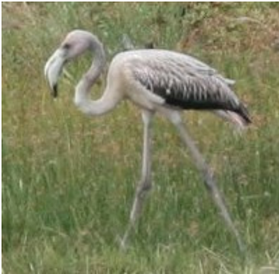
Fig. 5. Juvenile flamingo ( Phoenicopterus ruber or P. roseus ) by airstrip, 6 December 2010.