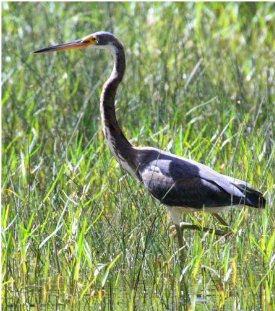
Fig. 9. Tricolored Heron ( Egretta tricolor ) at the palm grove ponds, 1 November 2007.

August, and November (RS). On 2 February 2010 four were at the Bird sanctuary with other egrets (MP).