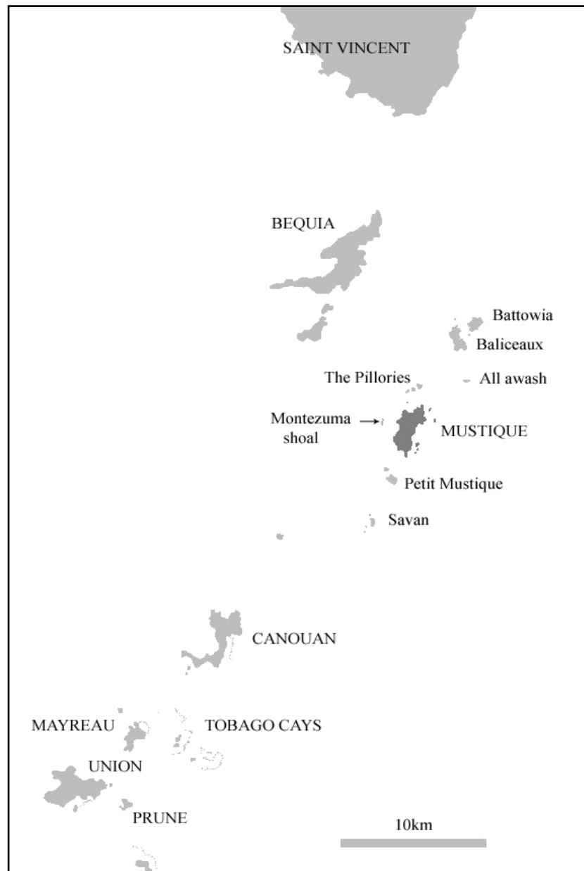
Fig. 1. Map of Mustique and nearby islands within St Vincent and the Grenadines.

for each species: (1) The highest count seen on one occasion (e.g., a flock seen together, or the number seen on one visit to a particular site) per annual visit. (2) The total number of sightings of one or more birds per annual visit. (3) All records were summed according to named habitats, to provide a guide to habitat use. For some habitats (e.g., wetlands), individual sites have been treated separately to allow comparison.