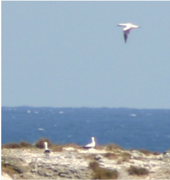
Fig. 7. Masked Booby ( Sula dactylatra ) colony at Brooks Rock, 28 January 2007.

Pillories, mainly in winter; doesn't appear to breed (Clark 1905, Frost et al. 2009). Occurs in the Antilles and nests in southern Cuba (Bond 1950). Seen along the coast on nearly every visit, occasionally fishing off the headland at Lovell and by Gellicieux Bay, and roosting on small islets amongst the Pillories and formerly at Brooks Rock when there was a small tree. Up to four seen together (MP). Also noted in August and November in 2007. An individual fishing off the beach to the west of the Cotton House on 10 July 2008, was the first sighting in almost 6 mo. By 5 September 2008, a dozen or more were present (RS).