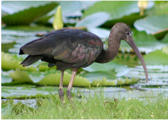
Fig. 10. Glossy Ibis ( Plegadis falcinellus ) at Cotton House pond, 22 January 2005.

breeds virtually throughout the West Indies (Bond 1950). It occurs in all mangrove swamps and along the coast throughout the year. Seen on every visit with highest counts in the Bird Sanctuary of three in 1998, six in 2001 (estimated), and one or two in other years (MP).