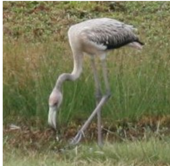
Fig. 6. Juvenile flamingo showing dark front of upper mandible. By airstrip, 6 December 2010.

dines' at Battowia Bullet, All-awash Islet, and Kick-em Jenny' (Bond 1950). No breeding colonies found in 2004 (Frost et al. 2009). On 3 February 1998, one was seen on the ground and two in flight at Brooks Rock. Subsequent sightings at the same locality include: several possible sightings on 31 January 2001; two pairs and a single on the ground and another in flight on 6 February 2002; one pair and three separate singles on the ground on 28 January 2003; two pairs on the ground on 25 January 2005; three pairs and seven singles on the ground plus one in flight on 21 January 2006, suggesting 10 nest sites; eight birds plus a possible juvenile on the ground at seven separate sites, and others in flight on 28 January 2007 (Fig. 7); five pairs and three singles on 4 February 2008; 11 on 31 January 2009; and six singles, three pairs (nine sites) and two fully grown chicks on 4 February 2010. Brooks Rock was not surveyed in 2004 or at other times of the year by MP, but Masked Boobies were there in early November 2007 (RS). Lowrie et al. (unpubl. report) found three chicks (first confirmed breeding record) in separate nests on Brooks Rock in May 2009, and found no other breeding colonies of this species in St Vincent and the Grenadines.