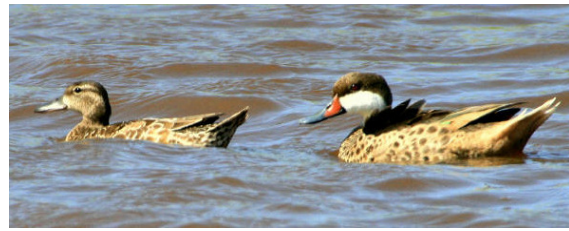
Fig. 3. White-cheeked Pintail ( Anas bahamensis ; right) with a Blue-winged Teal ( Anas discors ; left) at Rutland Bay pond, 29 October 2007.

Black-bellied Whistling Duck ( Dendrocygna autumnalis ). Recorded in Mustique on 6 February (year not stated; Bond 1950). An adult was seen and photographed at the Cotton House outer pond at 0837 on 19 August 2008, and was last seen on 20 August 2008 (RS).