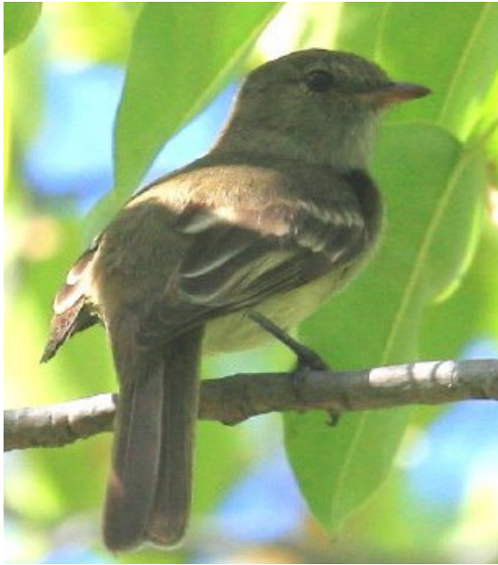
Fig. 12. Caribbean Elaenia ( Elaenia martinica ) at the Lagoon, 9 February 2009.

some of the Grenadines including Mustique, otherwise it is absent. Breeding has been recorded in the Grenadines (Clark 1905). Common on most of the islands in the Lesser Antilles (Bond 1950). Groups of four to eight (probably the total populations) have been seen in grassland and parkland around the airstrip, in cactus scrub and grassland near Rutland Bay, and also by the goat enclosures to the north of the Lagoon (all lowland areas). Adults with recently fledged young inhabited the area approaching Rutland Bay on 25 January 2005. None appeared to be on the island during the 2004, 2006, and 2010 visits (MP).