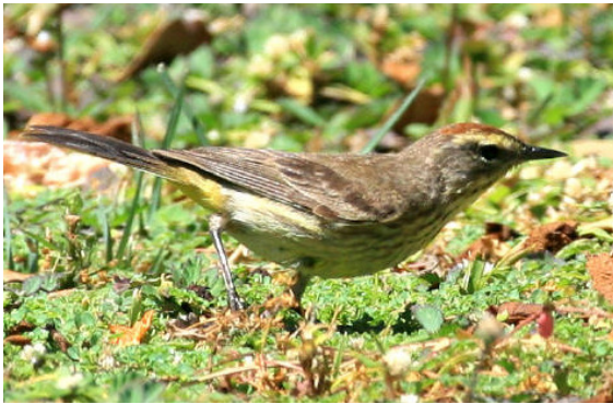
Fig. 14. Palm Warbler ( Dendroica palmarum ) by the Cotton House pond, 24 May 2008.

*Scaly-breasted Thrasher ( Allenia fusca ). After the hurricane of 1898 which devastated St Vincent, this species was found on Union Island and Carriacou where it was still present in 1902 (Wells 1902b); subsequently, after searching these islands thoroughly, Clark (1905) concluded that it had died out. There have been no Grenadine records since then. From 0930–1330 on 27 January 2010 two were feeding on a fig tree in fruit (probably Ficus citrifolia ) on a hill overlooking Britannia Bay (Fig. 13). They were seen again the following day, when they repeatedly flew the same direction into woodland as if caching food or feeding young. Two or perhaps three were seen repeatedly up to 9 February 2010 (MP).