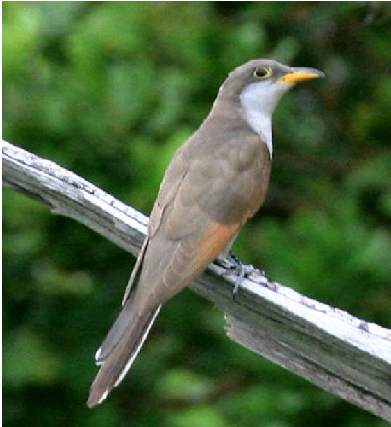
Fig. 11. Yellow-billed Cuckoo ( Coccyzus americanus ) at Rutland Bay, 17 November 2007.

Cotton House in mid December 2007, and another large flock appeared there on 12 February 2008. On 2 September 2008 one “Cayenne” Tern of the South American race eurygnatha was on the sand alongside 20 typical Sandwich and 20 Royal Terns at Pasture Bay (RS).