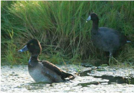
Fig. 4. Ring-necked Duck ( Aythya collaris ; left) and American Coot ( Fulica americana ; right) at Rutland pond, 7 November 2008.

female was observed from 1700–1720 on 31 January 2003 on the Bird Sanctuary lagoon, and again from 0800–1730 on 3 February 2003. On 7 November 2008 a male (probably a first-year) accompanied an American Coot ( Fulica americana ) at Rutland pond at 0804, flew to the palm grove ponds, and returned to Rutland pond by 0820 (Fig. 4). Subsequent sightings included 8 and 20 November at Rutland, and 27 November 2008 at the Bird Sanctuary (RS), and on 26 and 27 January 2009 (in adult plumage) at the Bird Sanctuary (MP and RS).