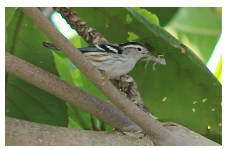
Fig. 1. Black-and-white Warbler ( Mniotilta varia ) with a bark anole ( Anolis distichus ) on San Salvador Island, The Bahamas, on 6 March 2020.

hypothesis seems extremely unlikely, as the records of vertebrates found in stomach contents document the consumption of lizards, including our new record in Jamaica (Table 1, Fig. 2), and we observed the Yellow-throated Warbler exhibiting prey-handling behavior.