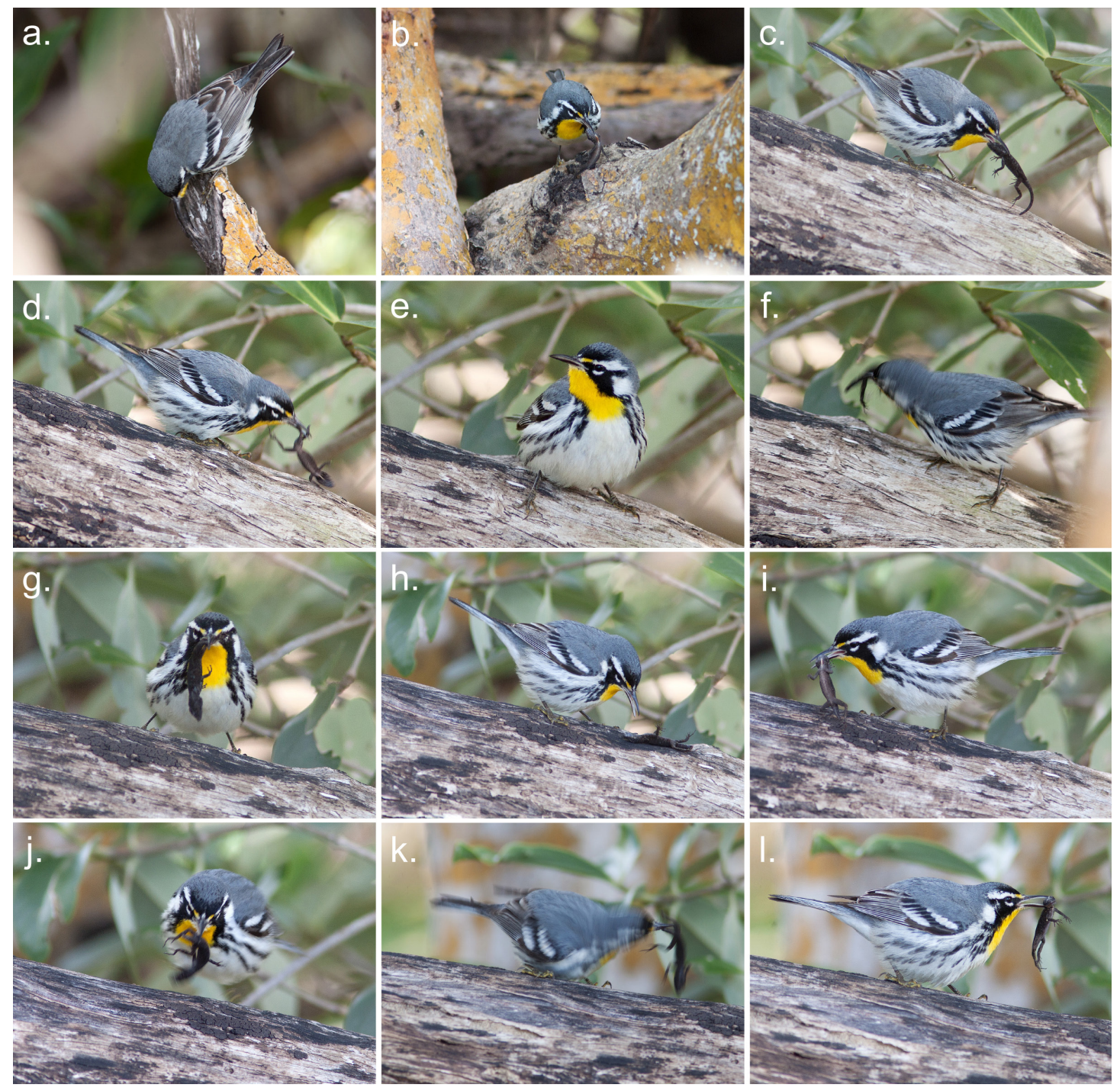
Fig. 3. Sequence of photographs of the Yellow-throated Warbler ( Setophaga dominica ) handling a brown anole ( Anolis sagrei ) in southwestern Florida, USA, on 8 February 2010. Times given as hr:min:sec. a) Bird is without prey, 13:28:13, b) catches anole, 13:28:38, c) still has anole, 13:29:05, d) has prey by leg and tail, but anole begins to escape, 13:29:06, e) without the anole, 13:29:13, f) begins to recapture anole, 13:29:15, g) recaptures anole, 13:29:18, h) anole is immobile on branch, 13:29:20, i–l) further handling of anole, including bashing on branch, 13:29:37–13:29:59.

gawa 1990, Hirvonen and Ranta 1996, Tremblay et al. 2005). Although a single anole has more weight and calories than individual invertebrate prey, it may have similar caloric content per gram compared to certain insect taxa (Vitt 1978, Ramos-Elorduy et al. 1997).