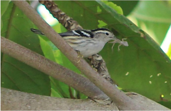
Fig. 1. Black-and-white Warbler ( Mniotilta varia ) with a bark anole ( Anolis distichus ) on San Salvador Island, The Bahamas, on 6 March 2020.

hypothesis seems extremely unlikely, as the records of vertebrates found in stomach contents document the consumption of lizards, including our new record in Jamaica (Table 1, Fig. 2), and we observed the Yellow-throated Warbler exhibiting prey-handling behavior.