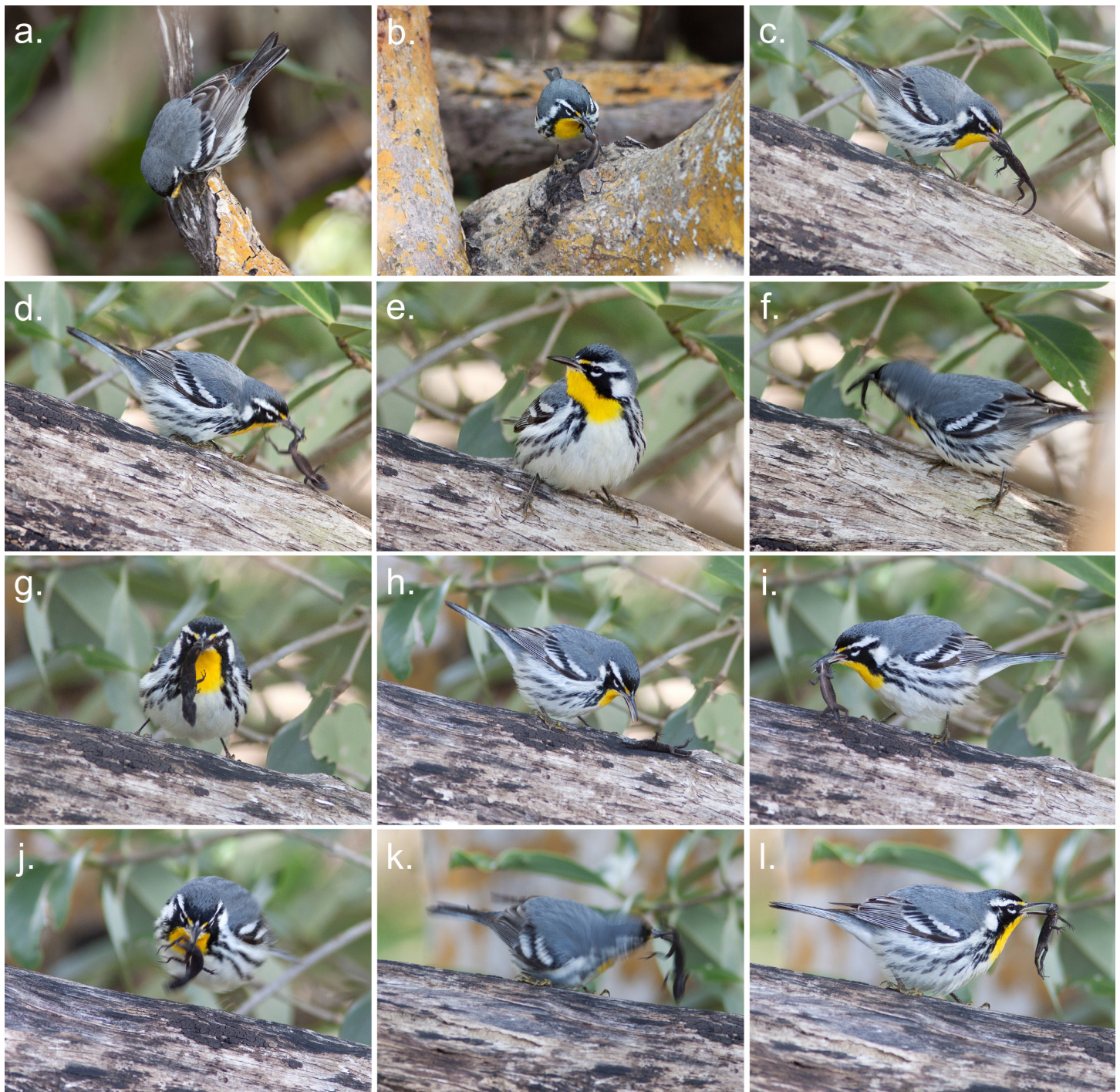
Fig. 3. Sequence of photographs of the Yellow-throated Warbler ( Setophaga dominica ) handling a brown anole ( Anolis sagrei ) in southwestern Florida, USA, on 8 February 2010. Times given as hr:min:sec. a) Bird is without prey, 13:28:13, b) catches anole, 13:28:38, c) still has anole, 13:29:05, d) has prey by leg and tail, but anole begins to escape, 13:29:06, e) without the anole, 13:29:13, f) begins to recapture anole, 13:29:15, g) recaptures anole, 13:29:18, h) anole is immobile on branch, 13:29:20, i–l) further handling of anole, including bashing on branch, 13:29:37–13:29:59.

gawa 1990, Hirvonen and Ranta 1996, Tremblay et al. 2005). Although a single anole has more weight and calories than individual invertebrate prey, it may have similar caloric content per gram compared to certain insect taxa (Vitt 1978, Ramos-Elorduy et al. 1997).