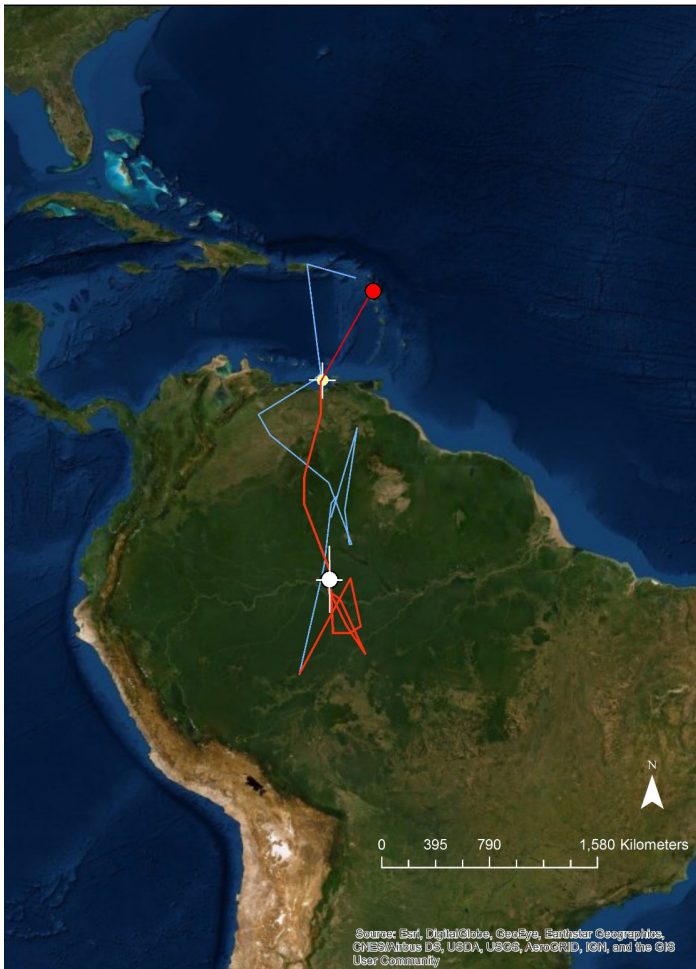
Fig. 2. A female Antillean Nighthawk’s stopover grounds on Isla La Tortuga (yellow dot) and Brazilian non-breeding grounds (white dot) were approximately 720 km southwest and 2,100 km south, respectively, of her breeding grounds on Guadeloupe (red dot). Daily median positions are shown with a blue line for fall migration and a red line for spring migration. The error bars indicate 1 SD around the mean stopover and non-breeding grounds locations.