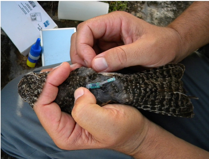
Fig. 1. We deployed a 0.65-g solar geolocator on a female Antillean Nighthawk using a leg-loop backpack harness made of Teflon tape.

Antillean Nighthawk observations recorded in eBird between November and March, during the non-breeding period (eBird 2018), correspond with much of the species' breeding distribution within the Caribbean islands (BirdLife International 2016). The known non-breeding distribution spans western Cuba to the eastern side of St. Thomas in the United States Virgin Islands (eBird 2018), and reaches from Bermuda in the north to Aruba in the south. These data suggest that Antillean Nighthawks may spend their entire annual cycle in the Caribbean islands and Bermuda. Nonetheless, we aimed to better understand the movements and non-breeding location of Antillean Nighthawks through the use of light-level geolocation. In July 2013, we deployed a geolocator on a single female Antillean Nighthawk and retrieved the unit in July 2014. Here we describe the migration, stopover, and non-breeding location of this bird.