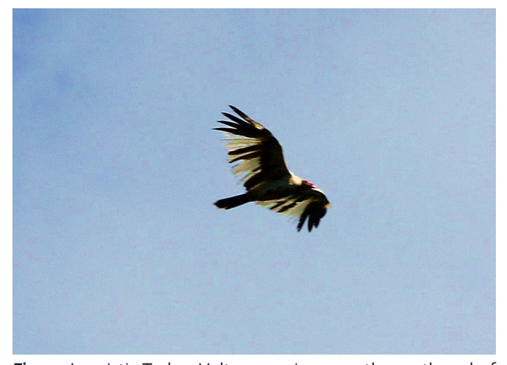
Fig. 2. Leucistic Turkey Vulture soaring over the north end of Barbecue Bottom Road, Cockpit Country, Jamaica (individual 1).

This individual was likely observed again in the same location on 10 February soaring above the valley and later perched on a tree on the side of a karst limestone rainforest hillside above the agricultural fields north of the end of Barbecue Bottom Road. This vulture's outermost four primaries, p7 to p10, were dark; p3 to p6 were white; p2 was black; and p1 was white. The first secondary, s1, appeared to be black, and the rest of the secondaries were white. The tertials were all dark, and the scapulars appeared to be white. There seemed to be some white in the underwing coverts, and the flanks and neck were clearly white (Fig. 2). When perched, the feathers visible on the back were