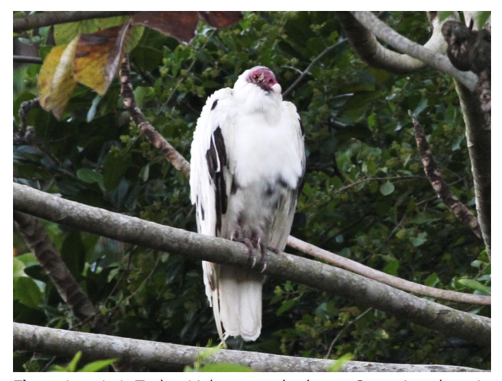
Fig. 3. Leucistic Turkey Vulture perched on a Cecropia peltata in Somerset, Jamaica, on a south-facing slope of the Blue Mountains (individual 4).

Individual 5.—Individual was soaring at the northern end of the Rio Grande Valley in the town of Fellowship. Two non-leucistic Turkey Vultures were observed soaring in the surrounding area. The plumage of this vulture was dark around the neck and on the upperwing coverts, although there were some scattered white feathers. Patches of approximately four white feathers